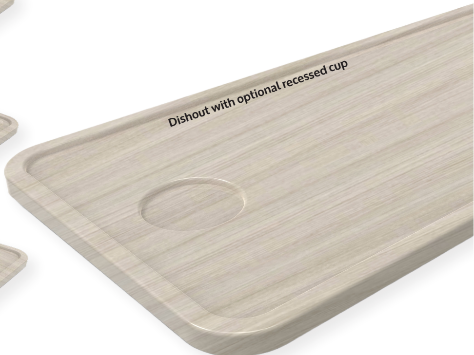
Dishout with optional recessed cup