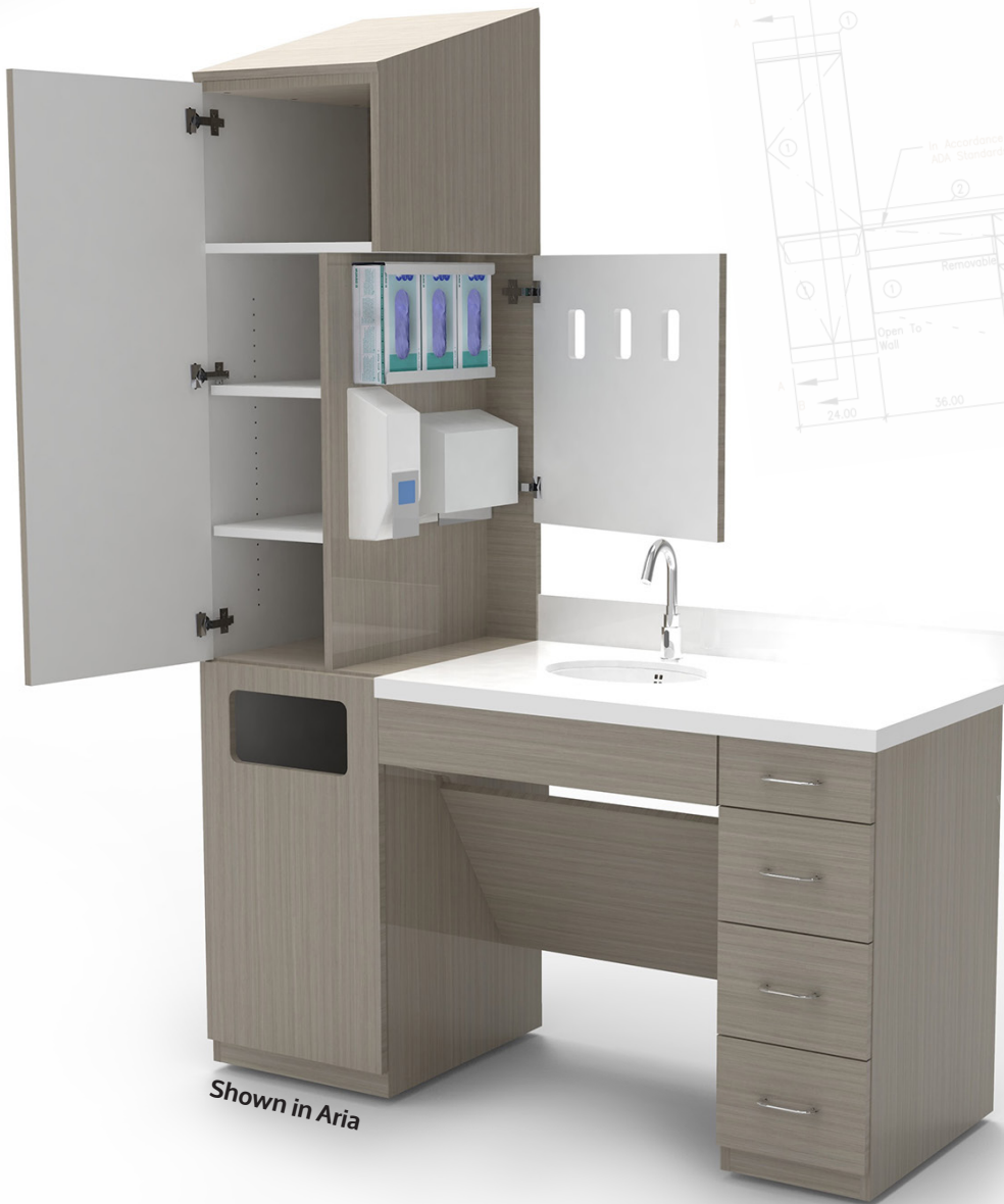
Shown in Aria