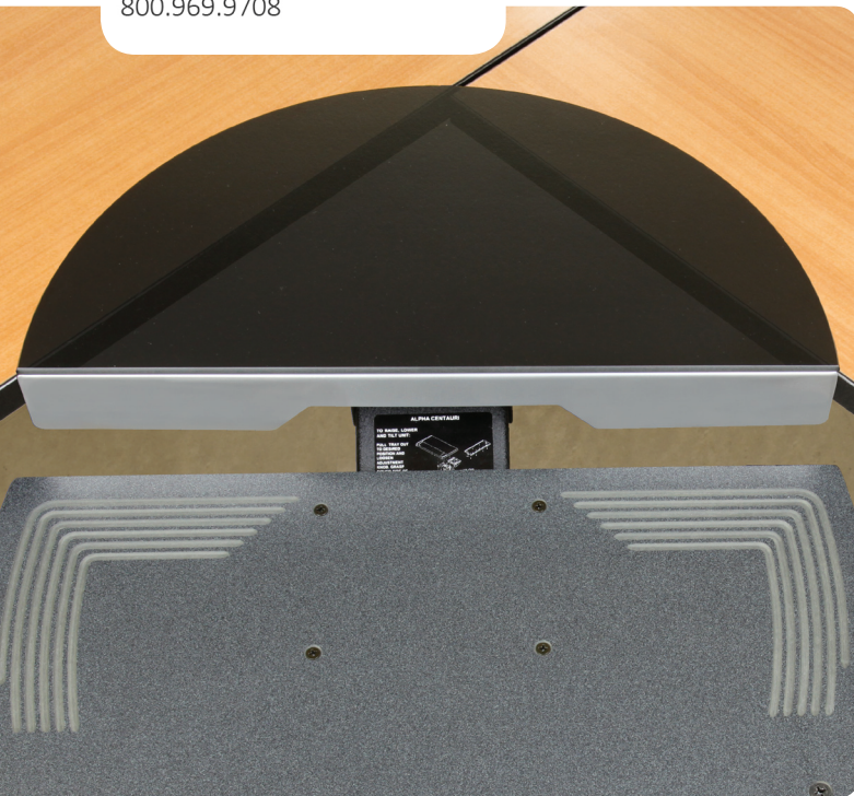
Keyboard systems sold separately.